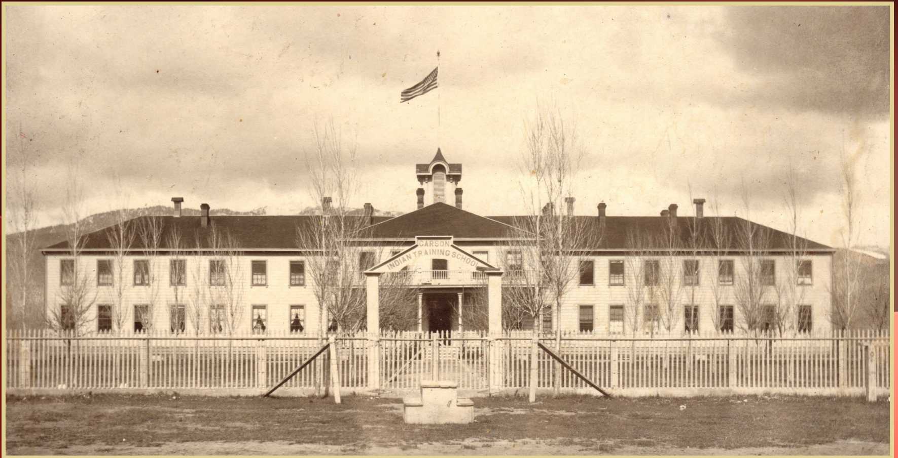
Stewart Indian Boarding School